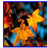
Autumn is here!

to continue in fellowship with my home church over the majority of weekends which has also helped me ensure time out from study to relax- something I don't always find easy to do.