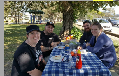
Picnic at Currumbin Creek, QLD