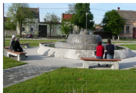
The New Park near my place!

God has been preparing me this last year in so many ways. He has been teaching me to trust in Him and His perfect timing and will, for which I'm grateful.