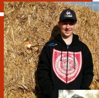
Haydn split the apple!