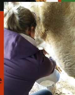
I had a go at milking