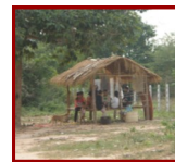
A Cambodian hut at the village!

Certificate in Biblical Studies Subjects: Biblical Theology; Hebrews; Psalms; Mark; Introduction to Degree Theology; Introduction to Preaching and Expounding Scripture (Preaching).