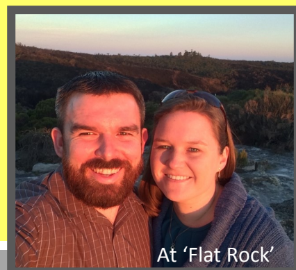
At 'Flat Rock'

» Pray that the Lord will continue to raise up more financial partners for my ministry roles, to enable us to not only live in Sydney but also cover ongoing ministry costs as they arise, such as a new computer which I will soon need.